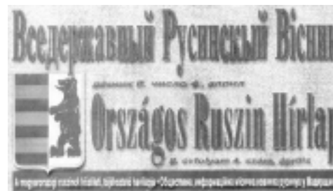
News magazine of Rusyns in Hungary.

Prague, Germany, and the former Yugoslavia, for example: The Society of Rusyn Language and Literature (Društvo za Ruski Jazyk i Literaturu), Novi Sad, Vojvodina, which publishes the Ruske Slovo [Rusyn Word] newspaper in the long-recognized as a literary