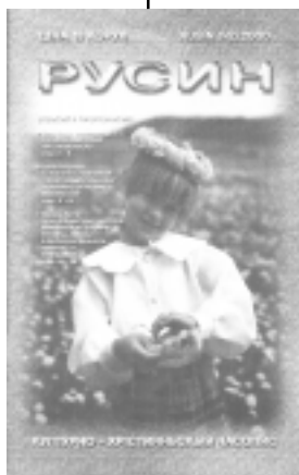
Recent issue of Rusyn magazine from Slovakia.