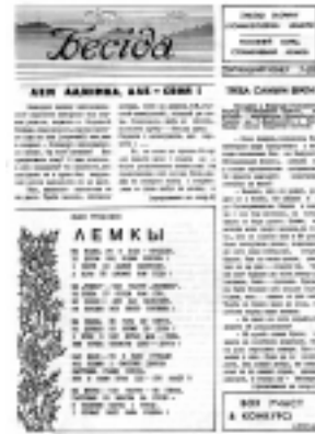
Early issues of Besida from Poland.

•The pro-Rusyn Lemko Association (Stovaryšynja Lemkiv [in Rusyn], Stowarzyszenie Łemków [in Polish]) is located in Lower Silesia at Legnica: This organization publishes the monthly Besida written in Rusyn, an annual Lemkivskij Kalendar [Lemko Almanac] and runs the Vatra-in-Exile.