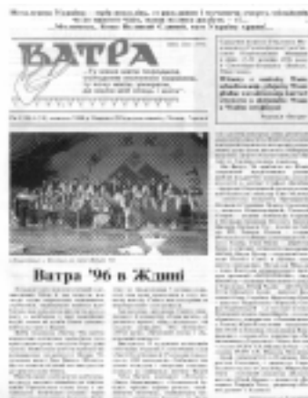
Vatra magazine from Poland.

•The aforementioned pro-Ukrainian Union of Lemkos whose headquarters are in Gorlice: runs the July Vatra event now permanently held in Ždŷnja, a town south of the city of Gorlice and adjacent to the Slovak border. It publishes, in standard Ukrainian and Polish, the newspaper/newsletter Vatra .