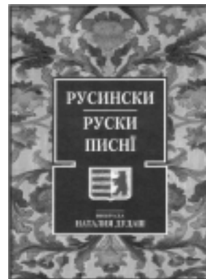
Anthology of Rusyn poetry, commissioned by the World Congress.