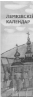
Lemkivskij almanac fr

An Organization of Rusyns in Hungary has been formed, which produces brochures, pamphlets and a newspaper/magazine ( Rusynskij žyvot [Rusyn Life], 1998-2000 and Vsederžavnij Rusynskij Visnyk [National Rusyn Messenger], 2000-present). Several universities in Hungary maintain Slavic departments that deal with Rusyn problems – Pecs, Debrecen, Budapest, see especially, Studia Ukrainica et Rusinica . In Europe there are also societies for Rusyn advocacy in