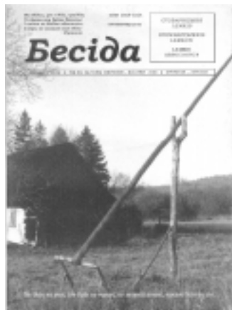
Recent issue of Besida from Poland.

“Ukrainian No More” (to use the title of a panel session at the American Association of Slavic Studies annual meeting in St. Louis, Missouri in November 1999). Where will this movement lead? All the participants in the Rusyn movement that the present writer knows proclaim that they are part of a social, cultural, and even national movement which intends to consolidate Rusyns into a community. There is no desire or plan to have Rusyns form a state entity – i.e., they will remain “stateless.” There is a great deal of hope that as Europe unites in NATO, Poland and Hungary already in, Slovakia a candidate and Ukraine affiliated in the Partnership of Peace program and as Poland, Hungary, and Slovakia (and eventually Ukraine) join the European Union, borders will become meaningless and a “Europe of the Regions” will appear. Thus a Carpathian-Danubian Basin Region would become a de-facto Rusyn region. Whether any of this will happen or whether the Rusyn movement will eventually wither away cannot be predicted. However, it is certain that the Rusyn movement will continue to be viewed by those who wish it ill as a nefarious plot of Moscow, Budapest, Berlin, anti-Ukrainians, secret police, secret societies, diaspora and local elites, anti-Catholics, anti-Orthodox, anti-Christians, Wall Street bankers, opportunists, capitalists and imperialists (take your pick).