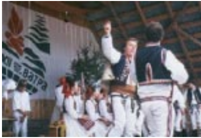
Vatra festival in Ždŷnja.

Lemko Region near the villages of Ždŷnja and Bortne, this several day event features folk dancing, songs, a language contest and discussions. Eventually, by the late 1990s, this event was captured by pro-Ukrainian Lemkos gathered in the Union of Lemkos (Zjednoczenie Łemków [in Polish], Ob'jednannja Lemkiv [in Ukrainian]).