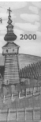
ij kalendar from Poland.

(Minneapolis, Minnesota) which publishes the occasional newsletter Trembita in English; the Rusyn Association of North America, Kitchener, Ontario, Canada, which is made up mostly of Rusyn émigrés from Vojvodina and published the quarterly magazine Hlasnjik in Vojvodinian Rusyn with some English. The latter three organizations are open to anyone who would like to join.