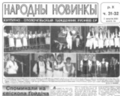
Recent issue of Narodny novynky from Slovakia.