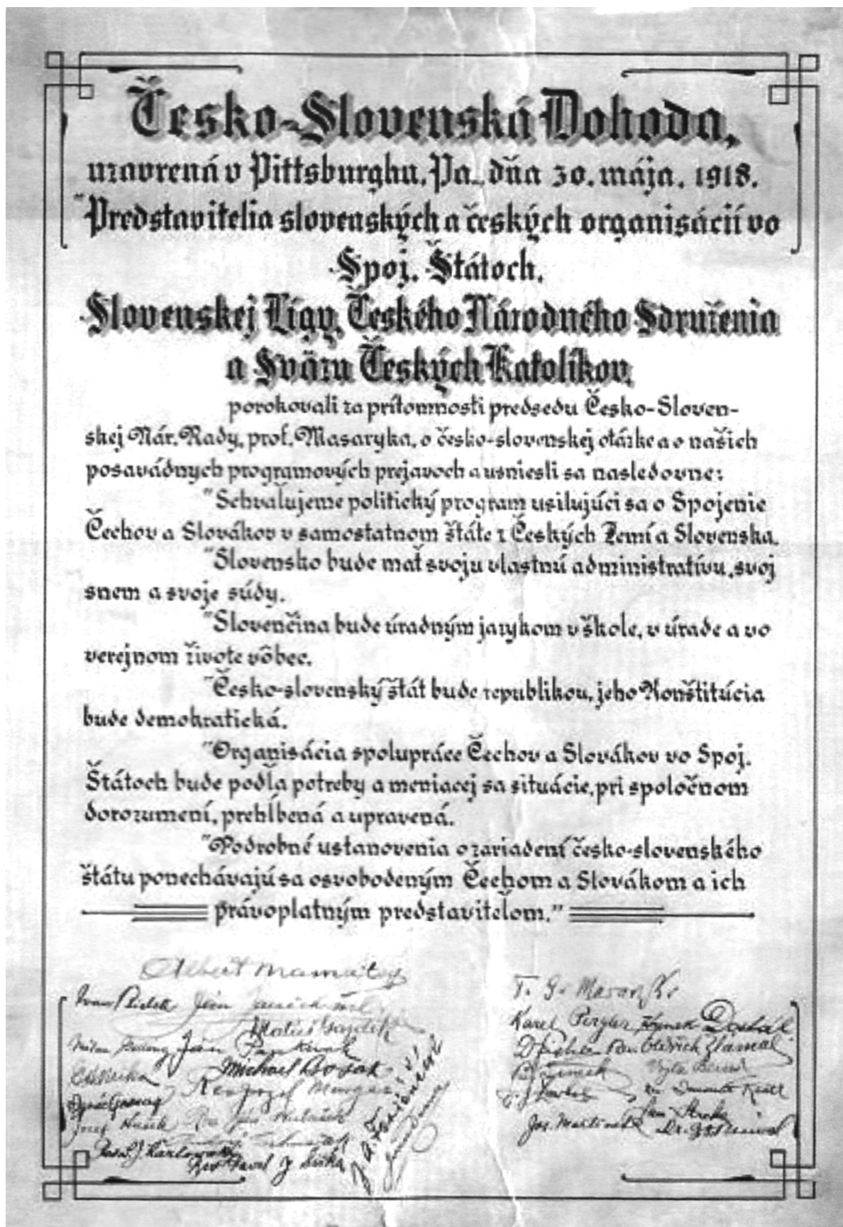
One of the original five copies of the Pittsburgh Agreement. A translation is presented at right.