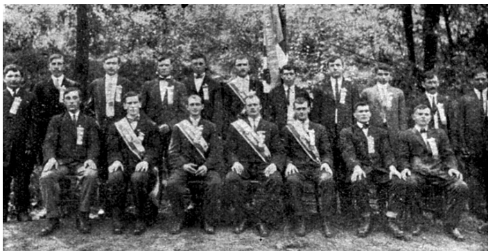
Lodge #6 Ss Cyril & Methodius Brotherhood, United Societies, West Newton, PA

In the decades following the 1848 revolution, influential circles in Subcarpathia fostered the idea of political cooperation with both Slovaks and Galician Rusyns and adopted the Russian language and cultural ideals for local intellectual life. It should be emphasized that the Subcarpathian intelligentsia had repeatedly rejected the Ukrainian national orientation and that the Galician contacts were almost exclusively with Russophile individuals and organizations there. Furthermore, since Subcarpathian Rus' was part of Hungary and subject to the assimilationist policy of magyarization, many Rusyn leaders (known as Magyarones) favored Hungarian civilization and considered themselves to be either Uhro-Rusyns (Hungarian Rusyns), or simply Hungarians of the Greek Catholic faith. Thus, a pro-Russian (and clearly anti-Ukrainian) or a pro-Hungarian cultural and political orientation, as well as a potential pro-Slovak political trend, were the predominant elements of late nineteenth-century Subcarpathian life that inevitably pervaded the intellectual framework of Rusyn immigrants in the United States.