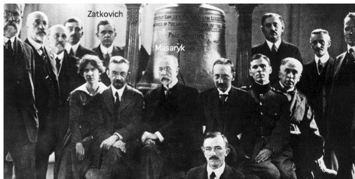
Masaryk and Zatkovich at the Philadelphia Convention

Presumably, President Wilson recommended seeking autonomy within some larger state and also advised Zatkovich and his colleagues to enter the Mid-European Democratic Union, a group of eastern European politicians representing eleven nationalities who organized a meeting on October 23-26 at Independence Hall in