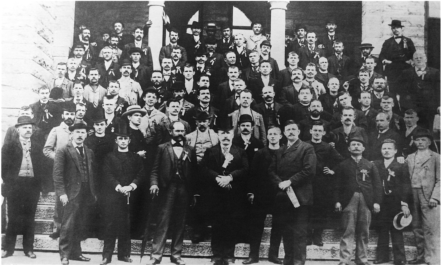
First Greek Catholic Union Convention, Scranton, PA, 1893

Russkich Bratstv), founded in Wilkes-Barre, Pennsylvania in 1892. This was basically an insurance organization concerned with the physical welfare of its members, though it also strove to preserve the integrity of the Greek Catholic Church in the United States. The Greek Catholic Union published an influential newspaper, the Amerykanskii Russkii Vístnyk (1892–1952), and by 1918 counted over 90,000 members in both regular and youth lodges. A smaller group formed the United Societies of the Greek Catholic Religion (Sobranije Greko-Katoličeskich Cerkovnykh Bratstv), also an insurance organization, but one administered directly by the hierarchy of the Greek