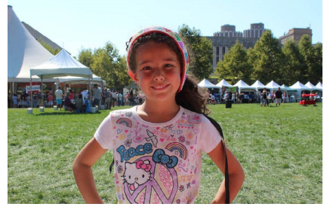
Little girl with Rusyn headpiece