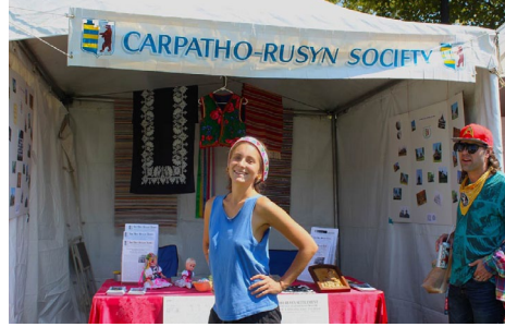
Visitor to the C-RS cultural display booth